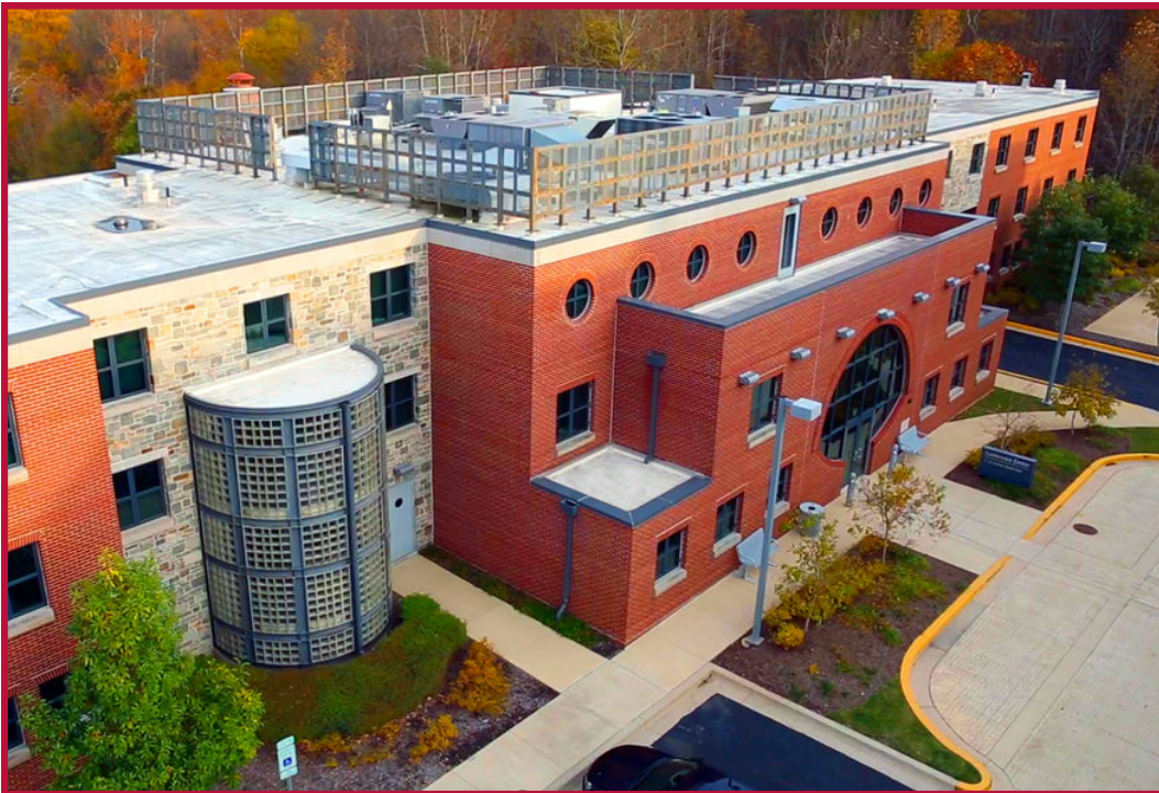
BAC/IMI INTERNATIONAL TRAINING CENTER - BOWIE, MD

As in other careers, education in construction is a continuing process. The construction trade unions offer more than Apprenticeship training. They also offer upgrade training for their journey workers. These programs allow for workers to keep their certifications and licenses current or learn new skills to match industry needs and new technology. These programs, too, are at no cost to the workers; they are negotiated by the unions and construction employers.